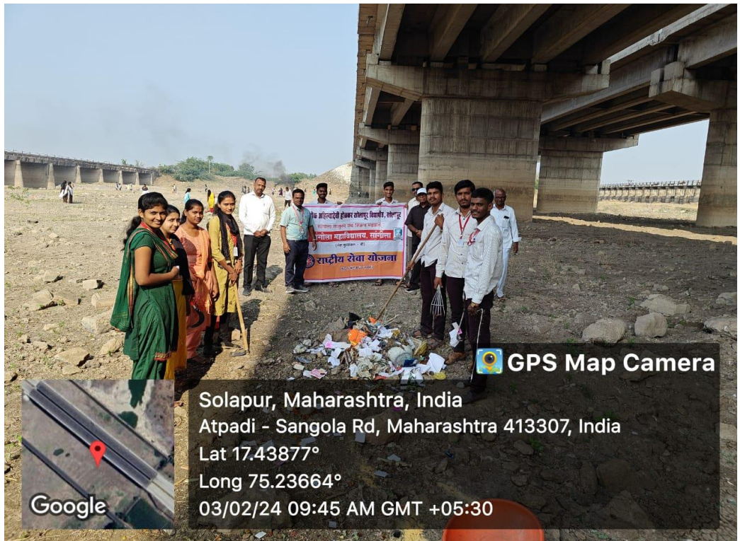
Maan river after Cleaning